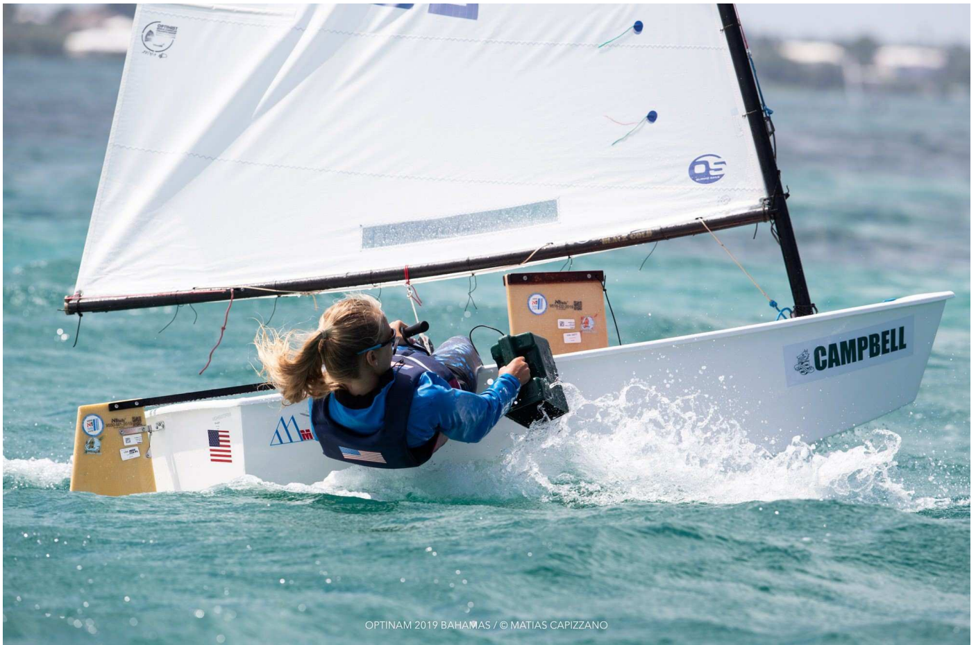
OPTINAM 2019 BAHAMAS / © MATIAS CAPIZZANO